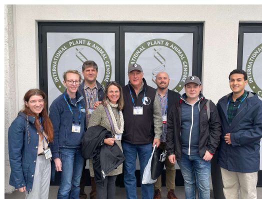
Photo: Members of our Equine, Canine, and Alpaca research teams.

VGL faculty, staff, and students attended this year's Plant and Animal Genome (PAG) conference , which took place in San Diego, California, January 13-18.