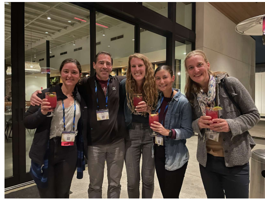
Photo: Members of the Mammalian Ecology and Conservation Research Team

The Center for Continuing Professional Education is hosting both the 9th Annual Winter Conference and the 38th Annual WAAM/AEMC Wildlife and Exotic Animal Symposium together in one weekend: February 25th - 26th, 2023. Information about the program and registration can be found here .